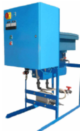
3 GPM EC System