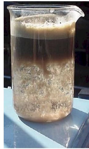
1) Meat Rendering Water Processed With The Powell Electrocoagulation System