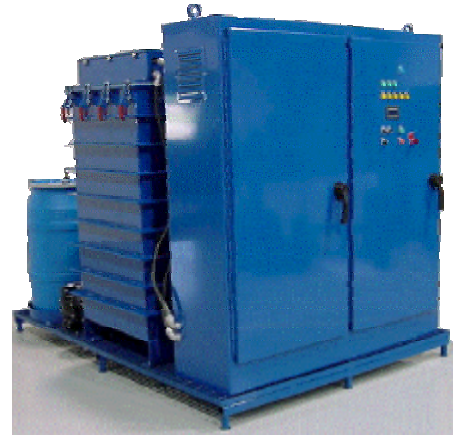
30-GPM EC System